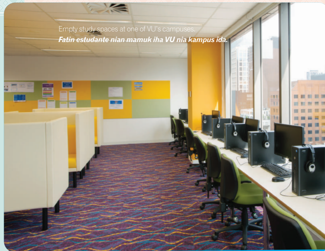
Empty study spaces at one of VU's campuses. Fatin estudante nian mamuk iha VU nia kampus ida.

atu servisu ne'ebé ami la uza iha konferénsia uluk nian.