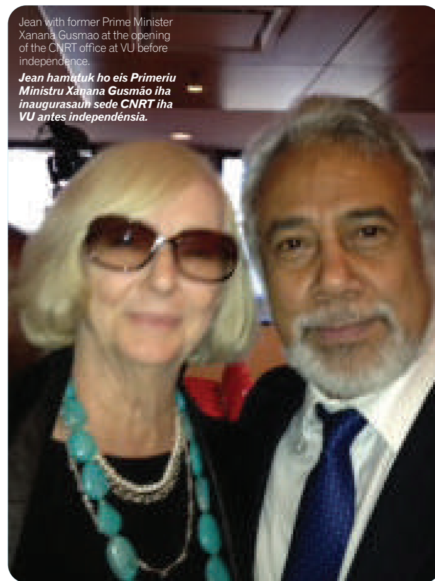
Jean with former Prime Minister Xanana Gusmao at the opening of the CNRT office at VU before independence.

Ha'u orgulhu tebes no iha respeita barak tebes ba Timoroan sira