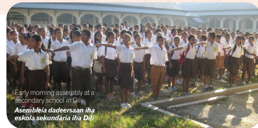
Early morning assembly at a secondary school in Dili. Asembleia dadeersaan iha eskola sekundária iha Dili

ba ami atu uza 'breakout rooms' ne'ebé estudante sira bele tama ba grupu ki'ik no hala'o atividade hamutuk. Sira dalaruma halo peskiza, halo servisu kreativu, ka tau informasaun balu hamutuk hodi lori fila mai grupu boot no apresenta buat ne'ebé sira hetan iha sira-nia projetu peskiza. Ami fó enfaze ba kooperasaun no kolaborasaun iha lisaun (mata kuliah).