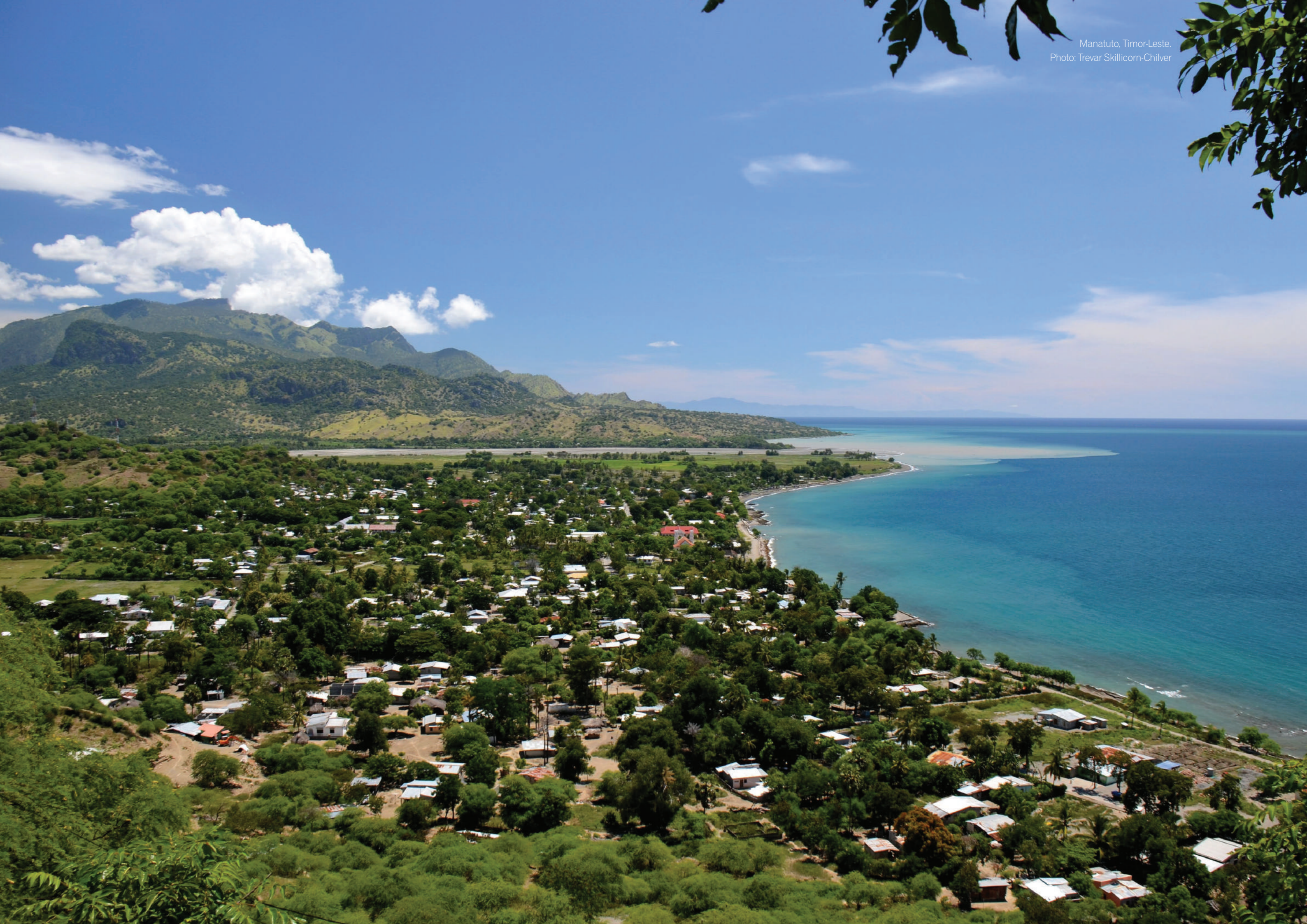
Manatuto, Timor-Leste.