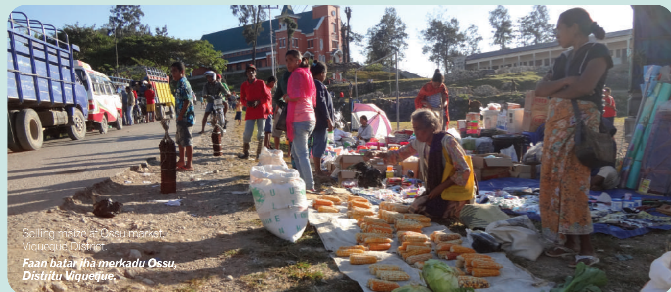
Selling maize at Ossu market, Viqueque District.