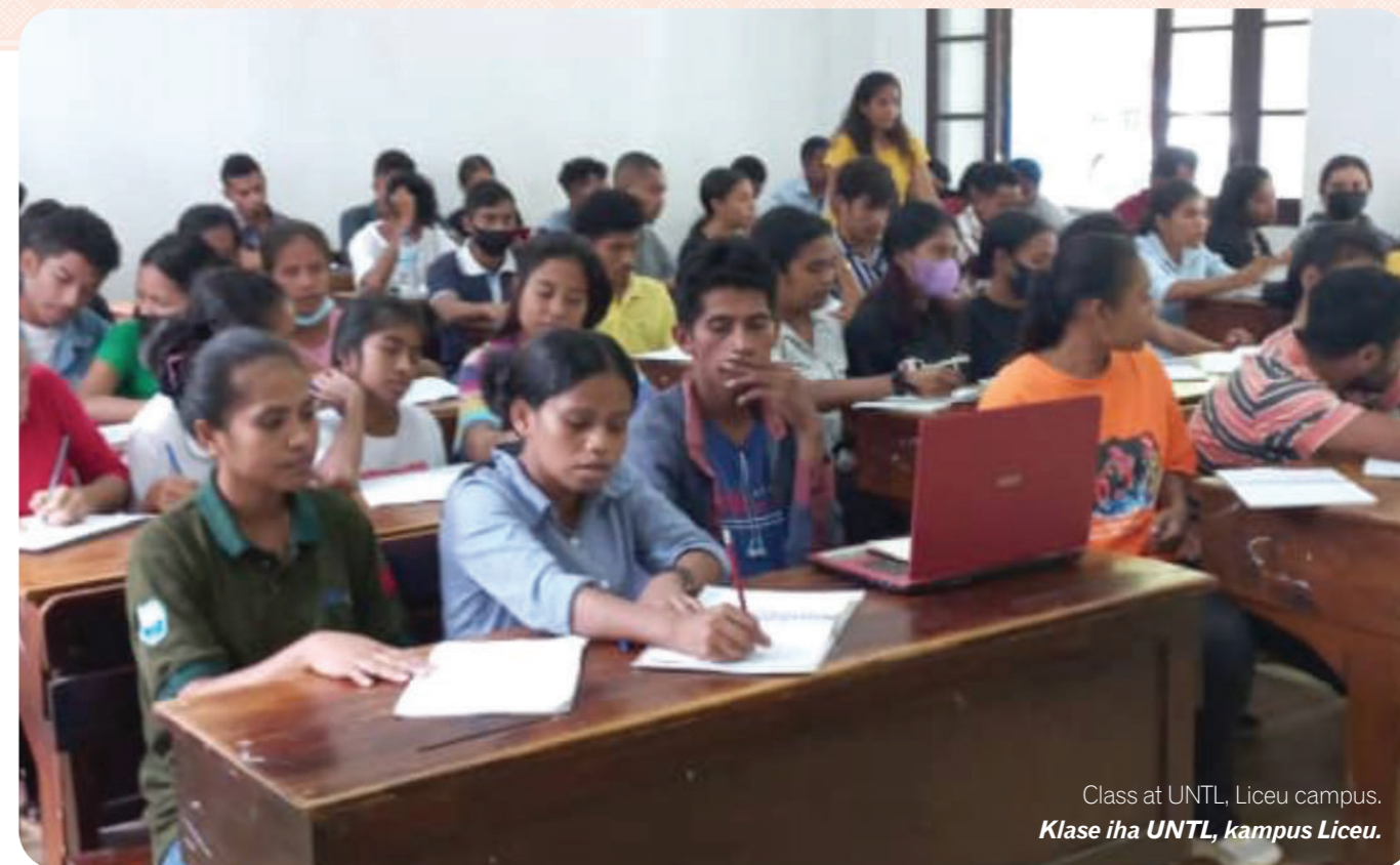
Class at UNTL, Liceu campus. Klase iha UNTL, kampus Liceu.

dosente balu ne'ebé dehan katak aprende uza programa onlain ne'e importante tebes.