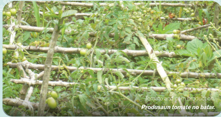
Tomato and corn production. Produsaun tomate no batar.

Adopting a whole of society approach, Timor-Leste has developed and launched several ministerial strategies and policies spanning across health, education, social protection, and gender equality to address undernutrition. As a result of these efforts, steady progress has been made in reducing levels of undernutrition with levels of stunting declining from 58% in 2010 to 47% in 2020, but challenges remain, and the country is not on track to meet global nutrition targets.