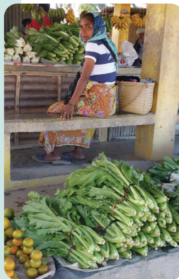
Vegetable market. Merkadu fa’an modo.

oin mai. Presaan ne’e sei mai husi ema sira ne’ebé protesta iha konferénsia ofisiál nia oin no mós fatin oioin iha mundu tomak. Protesta sira ne’e lidera husi Ema Rai-na’in Sira, estadu husi illa kiik sira, sientista sira, ema tinan ki’ik ne’ebé halo kampaña ba justisa klimátika no ema millaun ba millaun seluk.