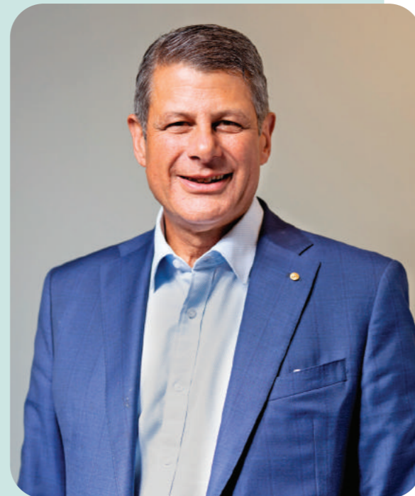
VU Chancellor, The Honourable Steve Bracks AC.

VU nia Xanselér, Sua Exelénsia Steve Bracks AC.