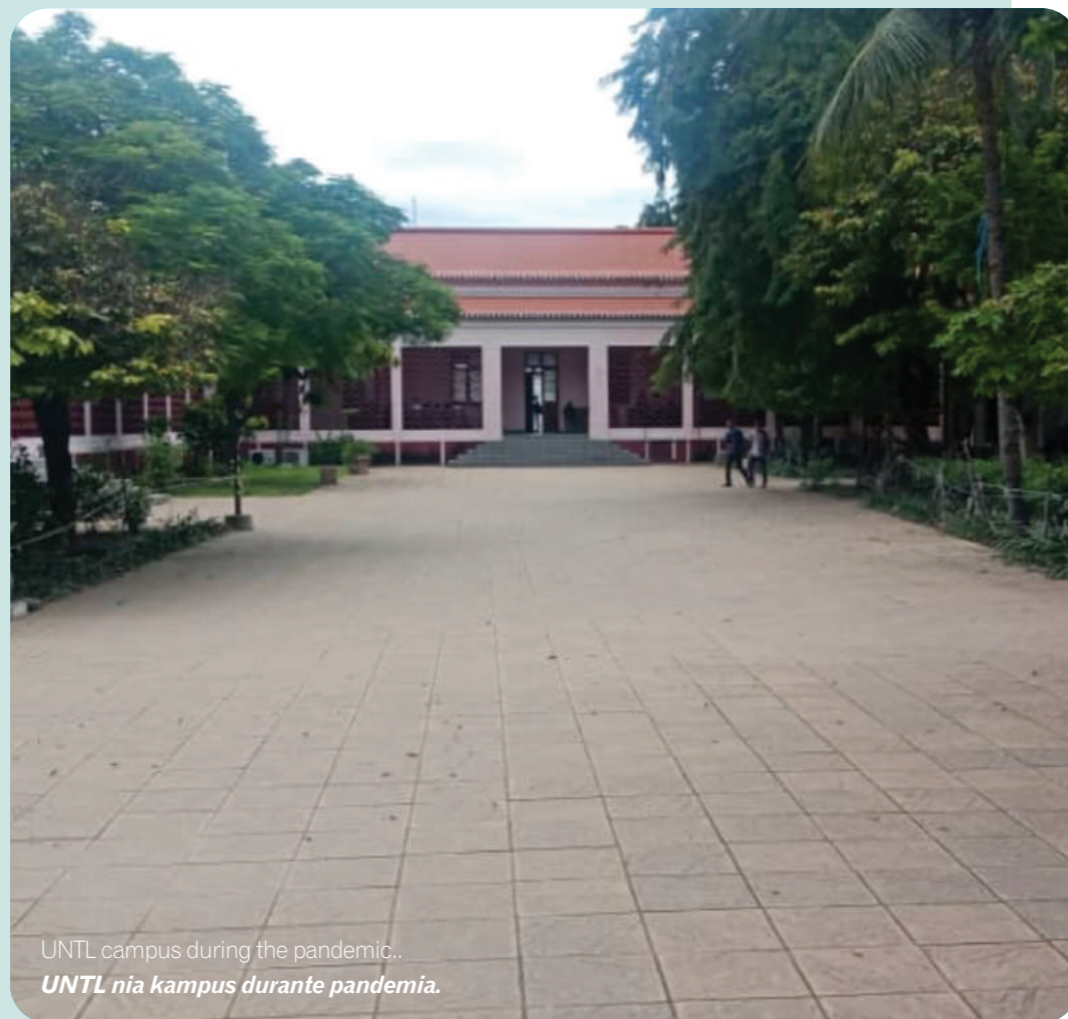
UNTL campus during the pandemic.. UNTL nia kampus durante pandemia.