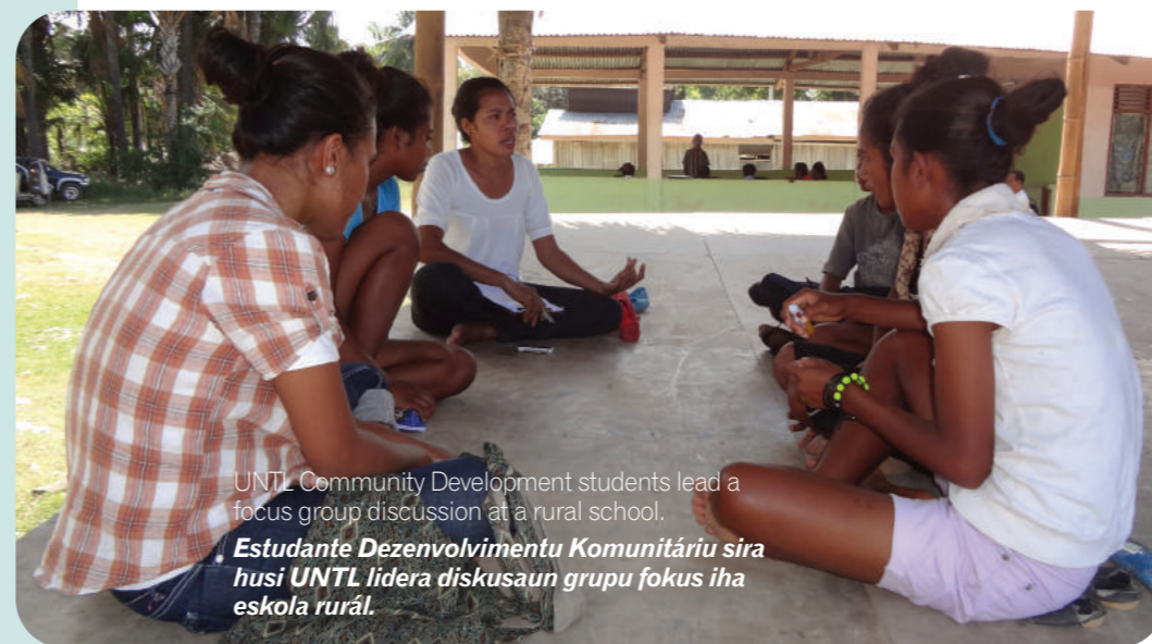
UNTL Community Development students lead a focus group discussion at a rural school.

Estudante Dezenvolvimentu Komunitáriu sira husi UNTL lidera diskusaun grupu fokus iha eskola rurál.