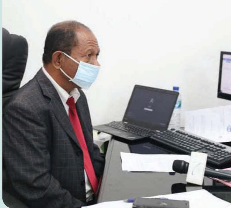
UNTl Rector at the 2021 conference. Reitor UNTL iha konferénsia 2021.

When embarking on planning the webinar we did not anticipate the challenges posed by floods and lockdowns in Dili and the level of stress that COVID would put on both UNTL and VU staff and their work. Following the terrible floods that inundated Dili in April the Rector asked for a postponement of the event until September. The dates of 27 September to 1 October were finally agreed upon.