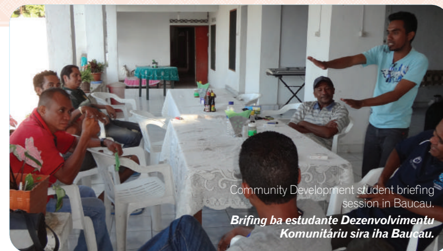
Community Development student briefing session in Baucau.

Ema ne'ebé servisu iha komidade ne'e rasik mak hola parte iha prosesu ne'ebé nunca para atu aprende abilidade foun, maneira atu hanoin foun, maneira foun atu haree mundu no maneira foun atu halo interasaun ho ema seluk. Iha papél edukasionál ne'e, profisionál sira envole an iha servisu komplikadu ne'ebé bele utiliza abilidade ne'ebé nivel simples, to'o iha nivel aas. Hodi suporta komidade nia agenda, dalaruma iha tempu balu ne'ebé profisionál komidade sira sente katak sira mós prezisa hetan abilidade foun balu. Profisionál komunitáriu nian tenke antisipa problema potensial sira ne'ebé dalaruma sei mosu se komidade falta koñesimentu relevante hodi proteje sira-nia an husi buat ne'ebé fó impaktu negativu ba sira. Pandémiku COVID-19 nu'udar ezemplu atuál, tanba komidade sira prezisa informasaun no koñesimentu barak kona-ba pandémiku