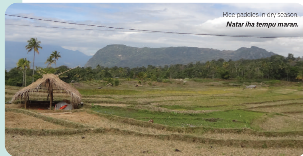
Rice paddies in dry season. Natar iha tempu maran.

Iha mundu, rai balu ne'ebé rendimentu nivel kraik no nivel klaran susesu ona redús stunting. Timor-Leste bele aprende husi rai hirak ne'e nia susesu. Thailand kria grupu voluntáriu saúde suku, barak liu mak fetu, ne'ebé hetan treinamentu atu fornese servisu nutrisaun no saúde báziku sira ba fetu no labarik sira iha comunidade. Ne'e inklui imunizasaun, servisu saúde reprodutivu, suporta hodi fó han bebé no labarik sira, servisu bee no saneamentu sira, no mós promosaun atividade agrikultura