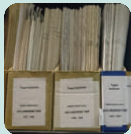
From the archives. Husi arkivu sira.