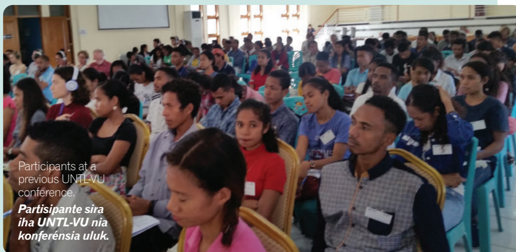
Participants at a previous UNTL-VU conference.