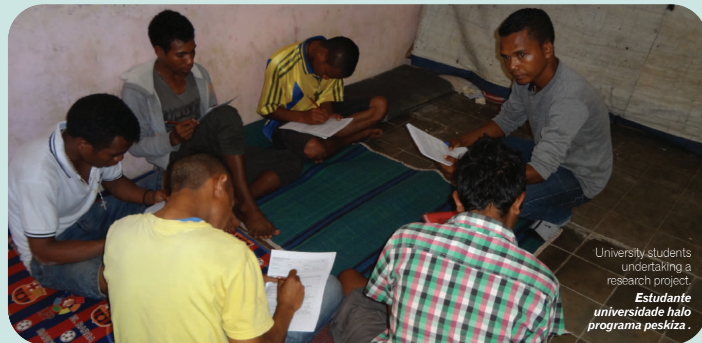
University students undertaking a research project.

Teaching is about facilitation. If we are good facilitators our instruction is useful and