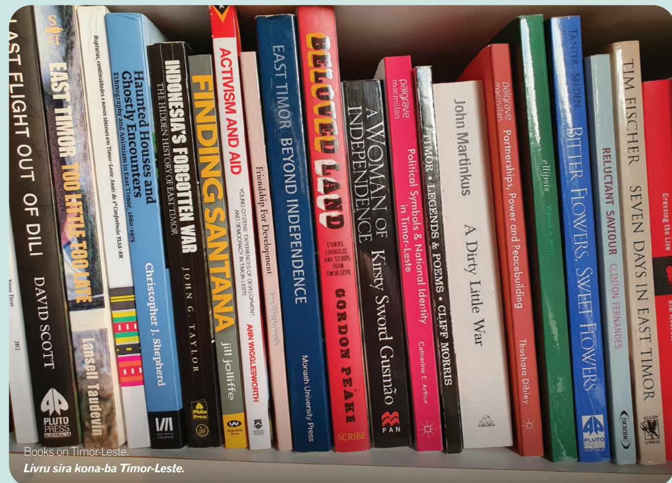
Books on Timor-Leste. Livru sira kona-ba Timor-Leste.