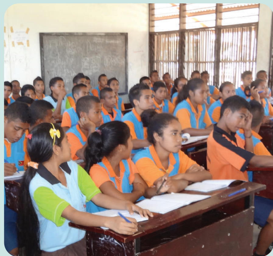
Secondary students at a rural Baucau school receive briefing from UNTL Community Development researchers.