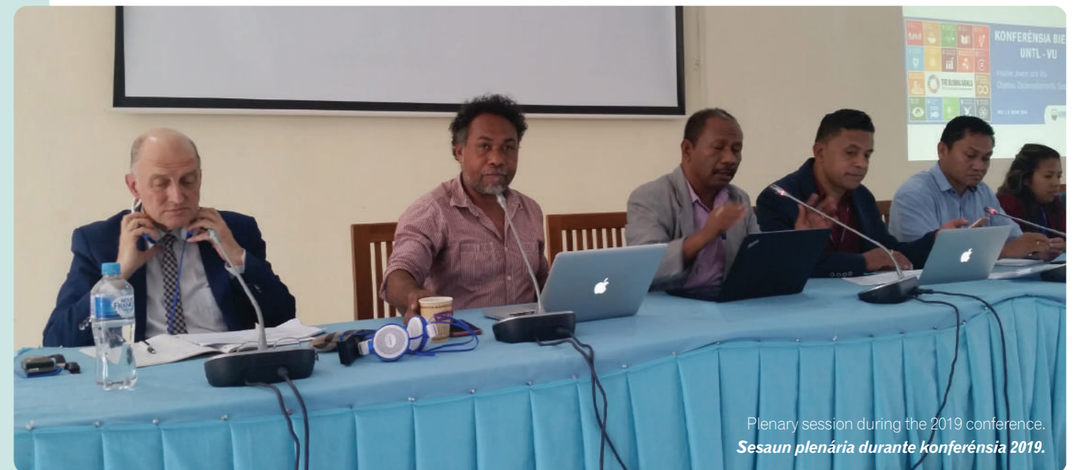
Plenary session during the 2019 conference. Sesaun plenária durante konferénsia 2019.